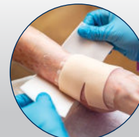
ADVANCED WOUND CARE