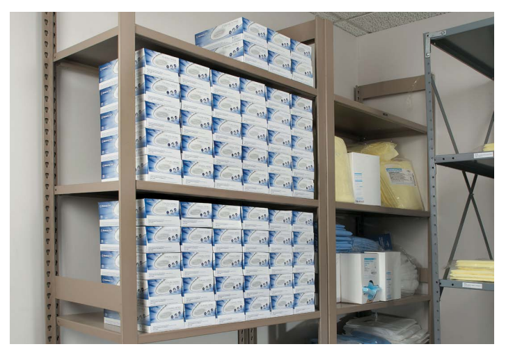
All gloves should be stored properly. Direct light, high heat, excessive humidity and ozone degradation from improper storage can lead to gloves with degraded barrier properties.