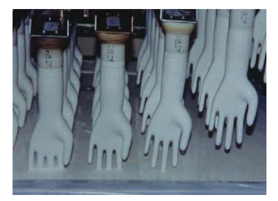
Glove formers being dipped into the liquid glove solution.