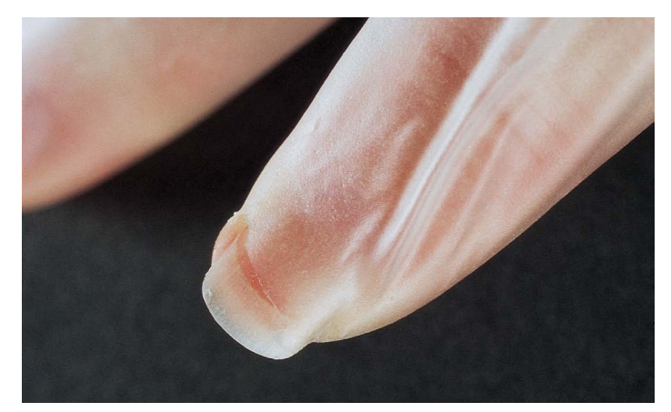
Artificial nails or long fingernails or the wearing of jewelry may snag, tear or puncture gloves.