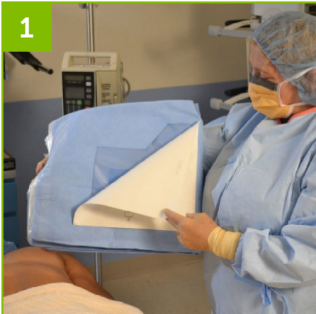
Step 1: Locate body stamp on folded drape and orient to the patient's femoral or IJ access point. Remove release liner paper for one or both fenestrations.

This combination drape has multiple fenestrations for use in both femoral and IJ line placements.