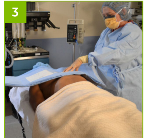
Step 3: Unfold drape, first laterally, then pull down to cover patient's feet.