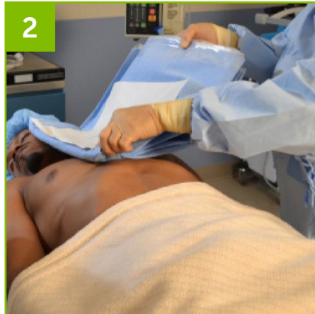
Step 2: Align drape with the selected access points and lower directly onto the insertion site. (IJ access point shown here)