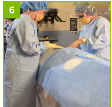
Step 6: This drape has clear windows on both sides for viewing and handling controls.