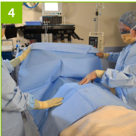
Step 4: Continue unfolding drape to cover patient's head.