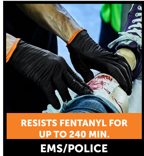
RESISTS FENTANYL FOR UP TO 240 MIN. EMS/POLICE