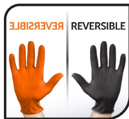
Two Gloves In One