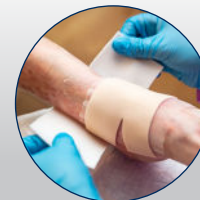
ADVANCED WOUND CARE