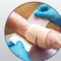
ADVANCED WOUND CARE