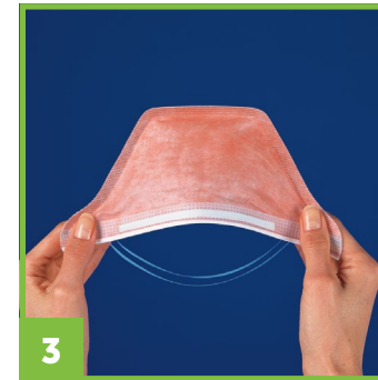
3 Hold the respirator upside down to expose the two headbands.