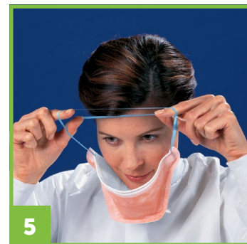
5 While holding the headbands with your index fingers and thumbs, cup the respirator under your chin.