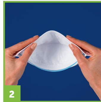
2 Slightly bend the nose wire to form a gentle curve.