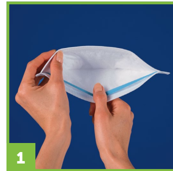
1 Separate the edges of the respirator to fully open it.