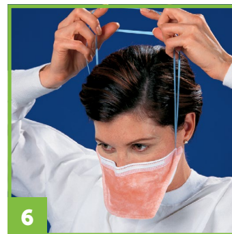
6 Pull the headbands up over your head.