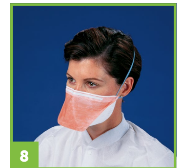
8 Position the remaining headband on the crown of your head.