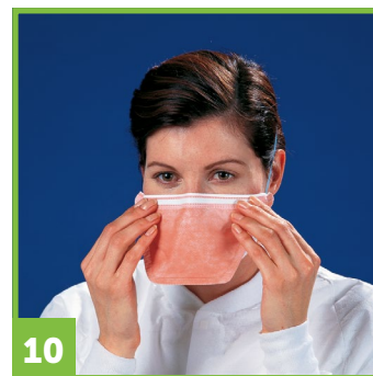
10 Continue to adjust the respirator and secure the edges until you feel you have achieved a good facial fit. Now, perform a user seal check.