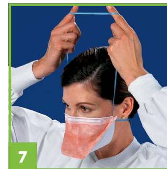
7 Release the lower headband from your thumbs and position it at the base of your neck.