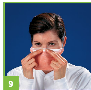
9 Conform the nosepiece across the bridge of your nose by firmly pressing down with your fingers.