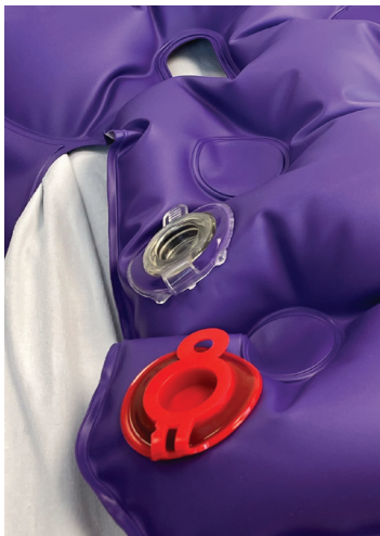
Inflation (clear) and CPR (red) Valves