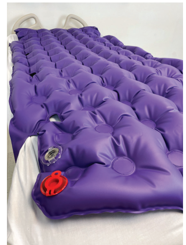
Inflated AirFloat Overlay