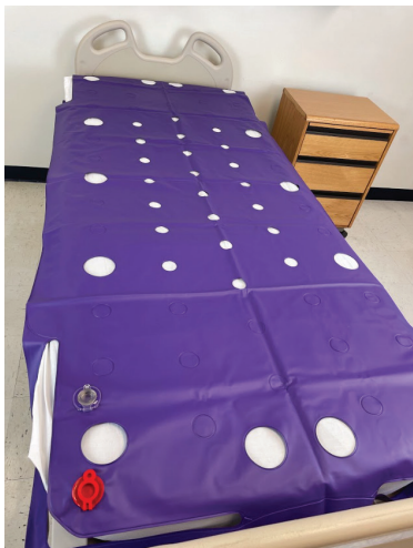
Uninflated AirFloat Overlay

*Always follow your facility's protocols